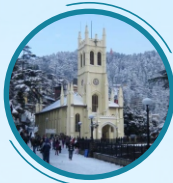
SHIMLA HIMACHAL PRADESH