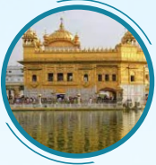
GOLDEN TEMPLE AMRITSAR