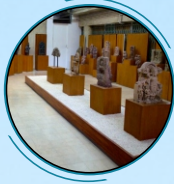
GOVERNMENT MUSEUM & ART GALLERY