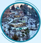
KASAULI HIMACHAL PRADESH