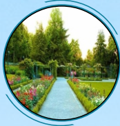
ZAKIR HUSSAIN ROSE GARDEN