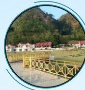
TIKKAR TAAL HARYANA